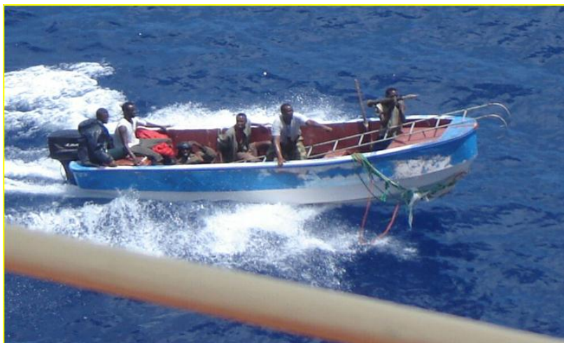
A typical skiff

It has been prepared by a Working Party staffed by experienced small boat sailors representing the following organisations: the Royal Yachting Association, the Cruising Association; the Ocean Cruising Club; the Royal Cruising Club and the World Cruising Club. The Working Party has drawn on information and advice provided by the Maritime Security Centre – Horn of Africa (MSCHOA), an initiative established by EU NAVFOR (EU naval force) Operation.