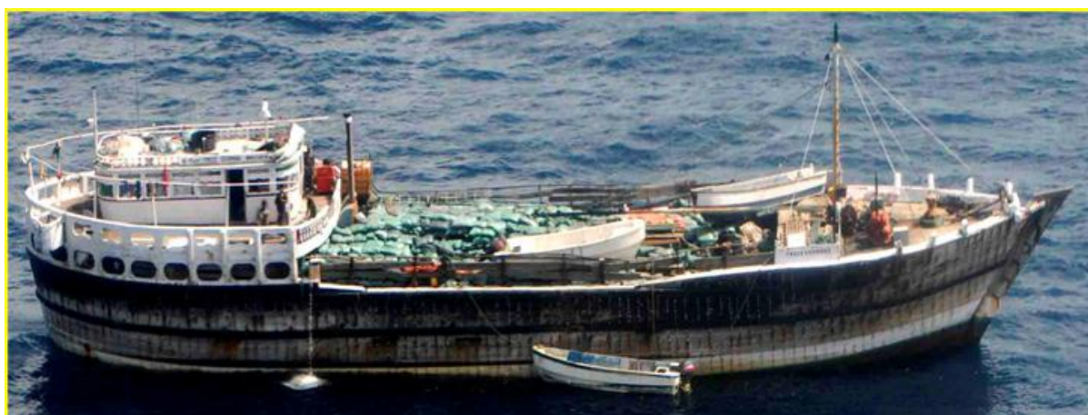
A typical mother ship

The PAGs do not need to be able to operate the mother ships they pirate; they use the vessel's crew to do that often treating them with extreme violence and keeping them in harsh conditions. Under the current rules of engagement governing action by the military, life cannot be put at risk. As a result, the pirates who are now no more than organised criminal gangs, have learned the value of using captive crews as hostages. If a Naval warship draws close, the pirates simply point a gun at the head of a hostage and threaten to pull the trigger if the naval ship does not pull away. The naval forces have no choice but to comply.